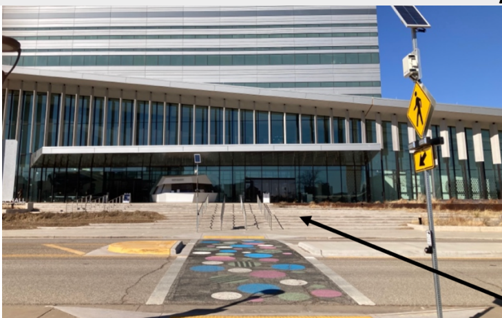
Door Entrance to Right of the Box Office