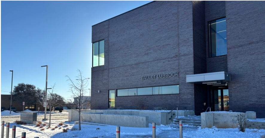
North Entrance (Ballet Lubbock

Main Entrance – Side Facing Marsha Sharp)