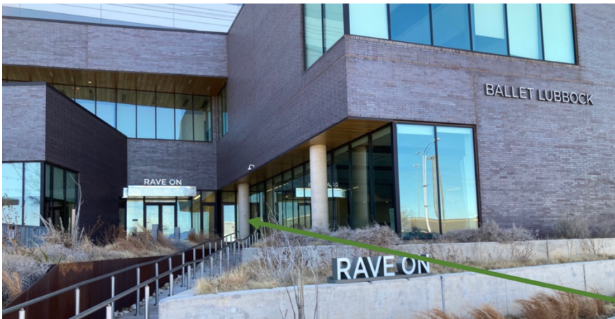
Door to the Right of Rave On

Walk your dancers to this Check-In Door: Cooper South , Centennial , Miller , Roberts , Wolffarth